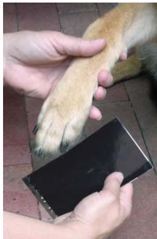
Ink the Paw

STEP 4. Bring the scrap paper to the inked paw or nose and gently touch it. Repeat this process until you are satisfied with the look of the practice prints. Now re-ink the paw or nose and create fresh prints on the order card or a clean index card.