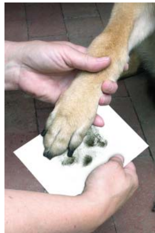
Take the Print