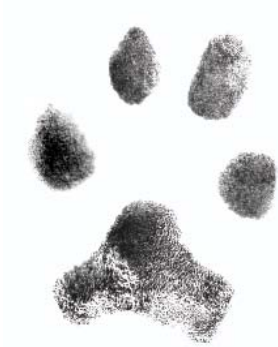
The Final Print

STEP 5. Using a wet paper towel, clean off the ink. Place all the scraps and ink strips in the trash.