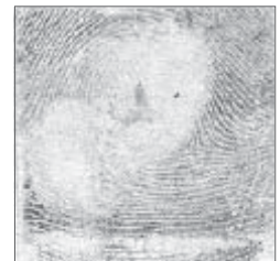
Good ink coverage, but rolled and smeared