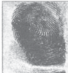
Too much ink, too much pressure