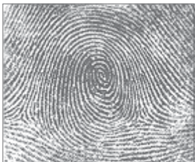
Good clear print!