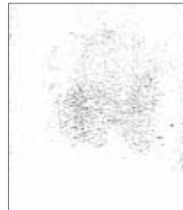
Too little ink, not enough pressure